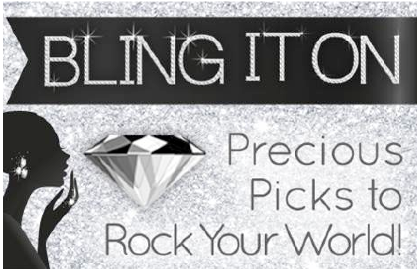
PRE-PROMOTION WEB BANNER – SCOOPON JEWELLERY SALE